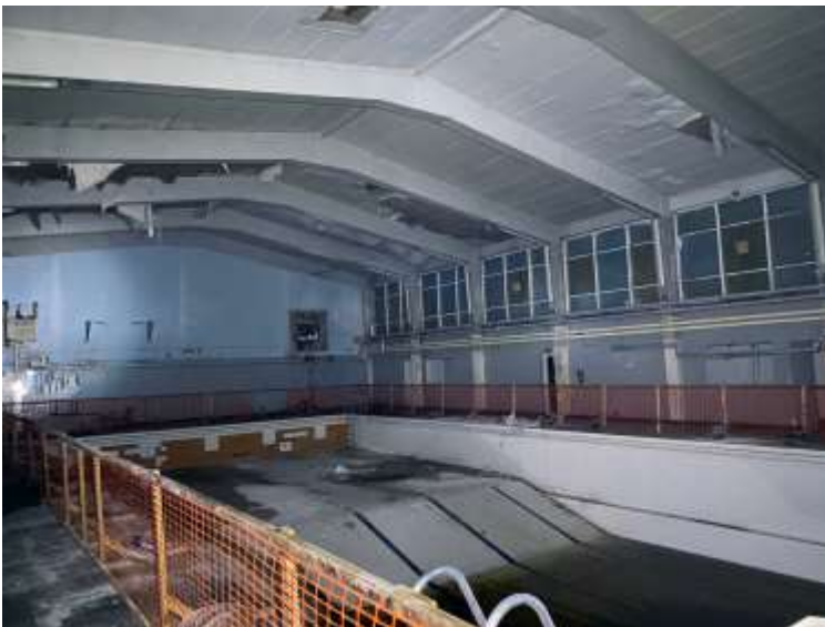
(The former Knightswood Swimming Pool as it is today).

The team will work closely with the local community and local stakeholders to deliver on the vision for an intergenerational shared space.