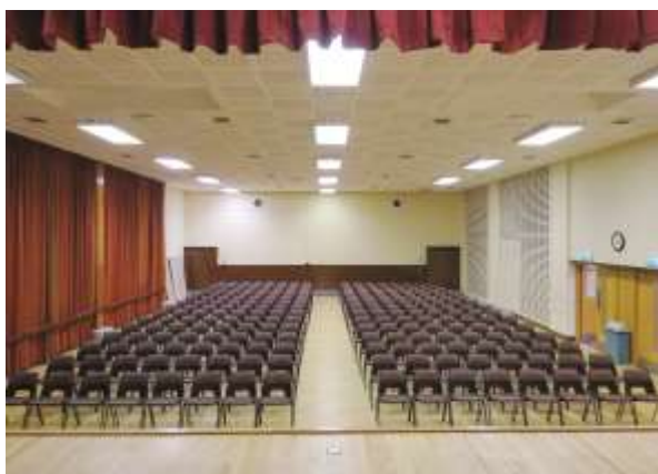
(Alderman Hall will be warmer now in the winter)

Knightswood Community SCIO has taken the opportunity during lockdown to modernise and upgrade facilities on the building. In October 2020 the Centre went through a major refurbishment of its electrical and plumbing infrastructure and has now running hot water throughout the venue.