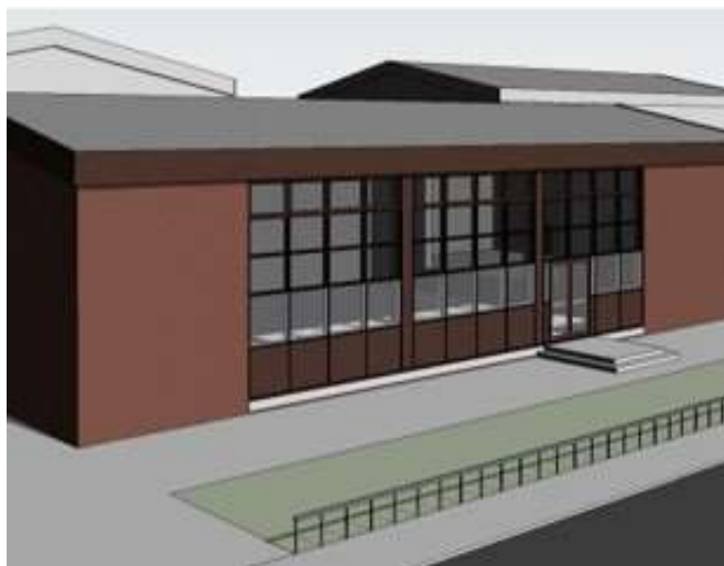
(Drawing outlining the proposed new curtain wall of the Alderman Hall).

Another major renovation is planned for May and June 2021. In the main Alderman Hall, the windows and the outside curtain wall are being replaced. The heating system being upgraded; this will resolve the hall being cold in the winter months. The bottom row of the new triple glazed windows will be made from obscured glass and this will provide a greater degree of privacy for the activities taking place in the hall. This renovation work was originally intended to be carried out during July last year however it was postponed because of the pandemic.